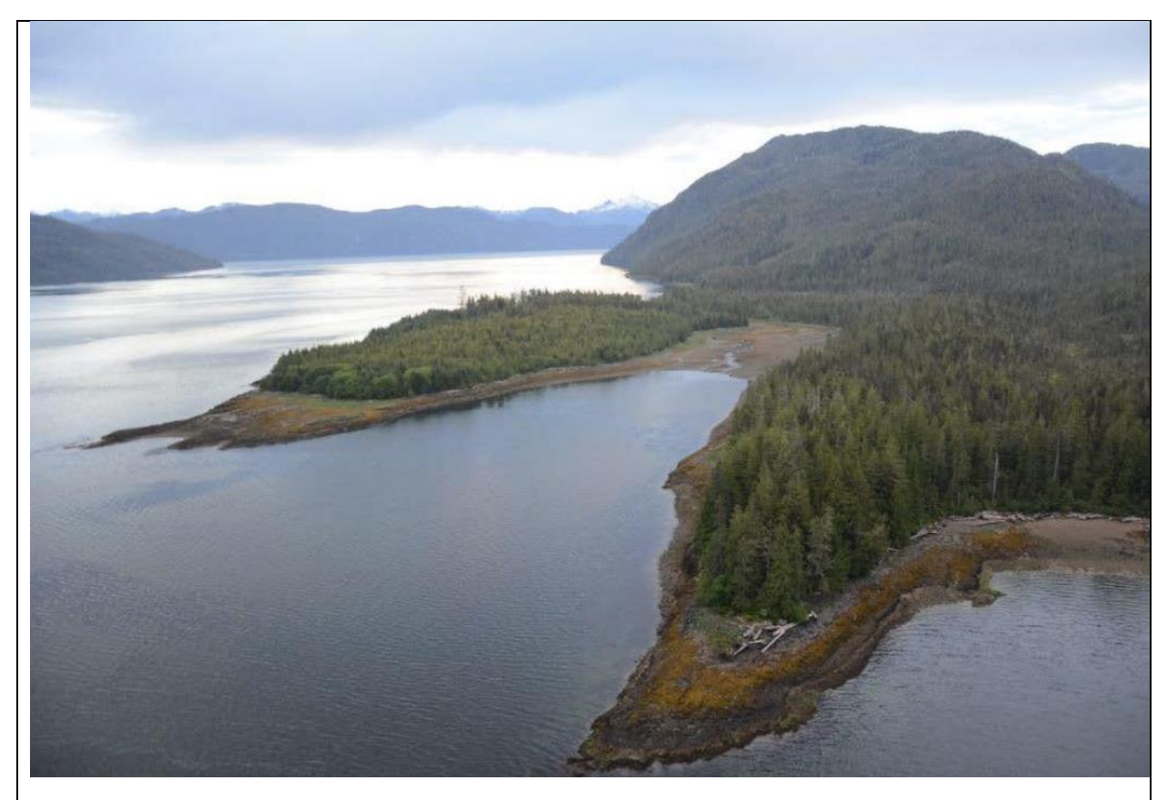
Photo of the Project site at the Northern End of Pearse Island, View to the South

The project is subject to review under the 2018 BC Environmental Assessment Act , the federal Impact Assessment Act and Chapter 10 of the Nisga'a Final Agreement . The BC Environmental Assessment Office (EAO) is leading the environmental assessment on behalf of BC and the Impact Assessment Agency of Canada.