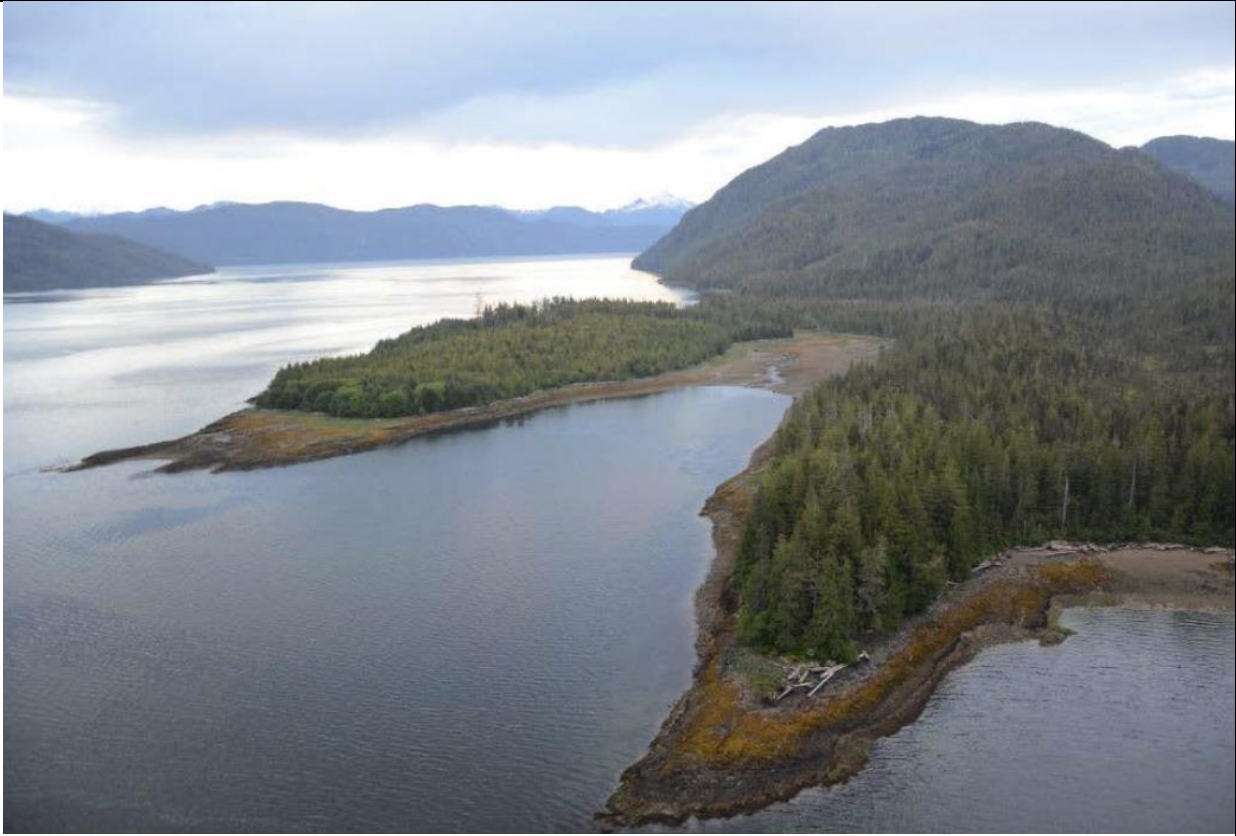
Photo of the Project site at the Northern End of Pearse Island, View to the South (Ksi Lisims LNG, Detailed Project Description, 2022)

The project is subject to review under the 2018 BC Environmental Assessment Act , the federal Impact Assessment Act and Chapter 10 of the Nisga'a Final Agreement . The BC Environmental Assessment Office (EAO) is leading the environmental assessment on behalf of BC and the Impact Assessment Agency of Canada.